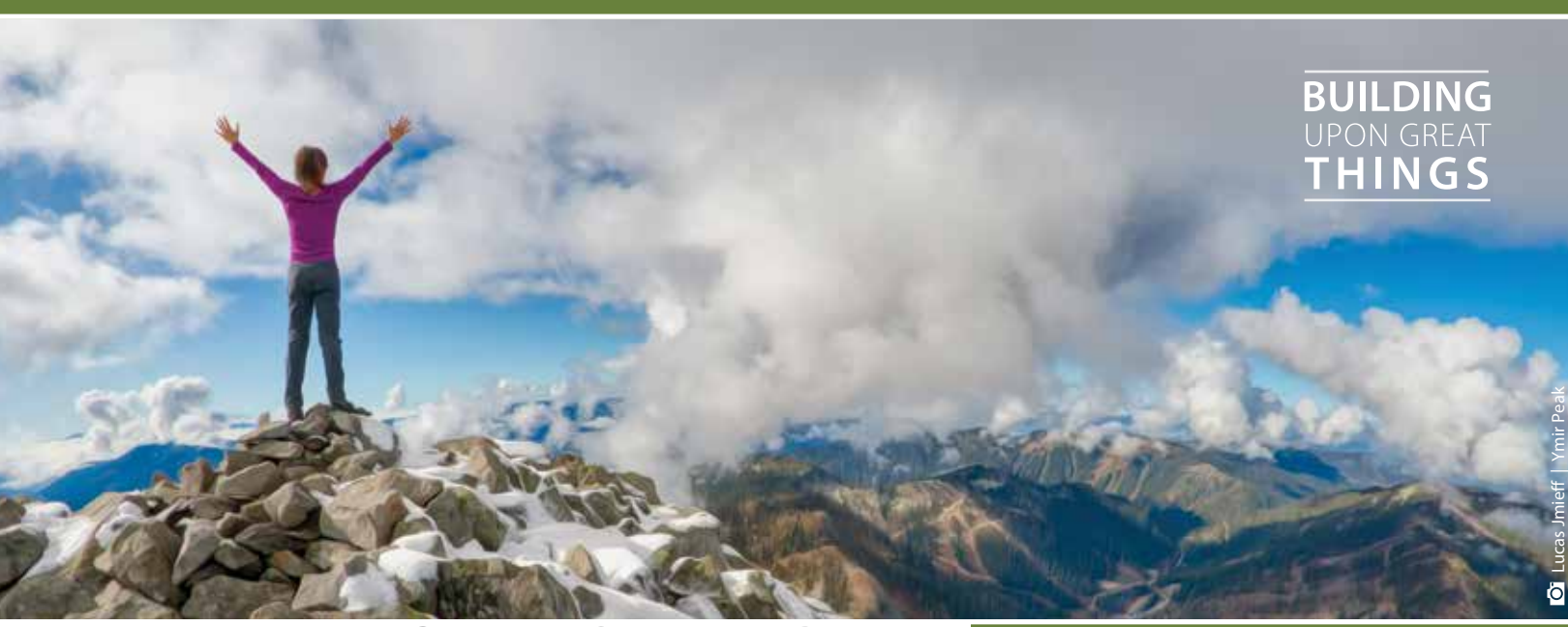
2023 Corporate Governance Report